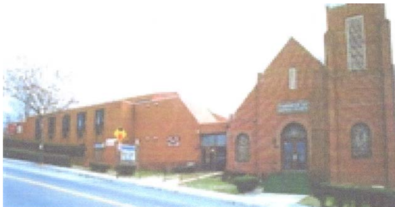
Our Present Church Building